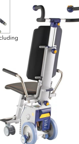
Harness belt including lap belt