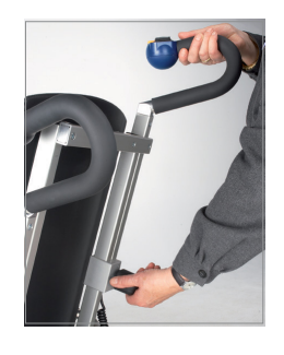
The torsion-free handles can be adjusted individually to the user increasing safe operation.

For your maximum comfort you can choose the climbing speed at your ease, a single step mode is an integrated feature that you can activate, if necessary.