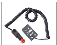
Charging cable for vehicle