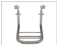
Height Adjustable Footrest