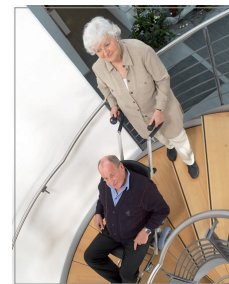
Winding stairs or steep steps are no problem for the c-max. The standard device already climbs steps of up to 21 cm in height.