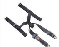
Harness belt including lap belt