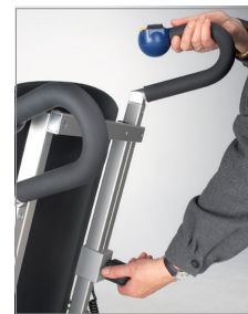
The torsion-free handles can be adjusted individually to the user increasing safe operation.

For your maximum comfort you can choose the climbing speed at your ease, a single step mode is an integrated feature that you can activate, if necessary.